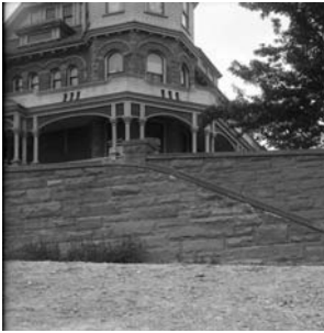
Fritsch Property at head of Main Street looking north, See This Old House, p 1..

NON-PROFIT ORG U.S. POSTAGE PAID Salt Lake City, UT PERMIT NO. 5919