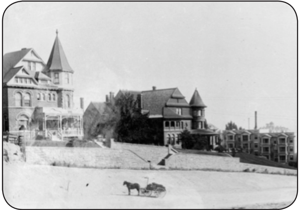
234 North Main Street